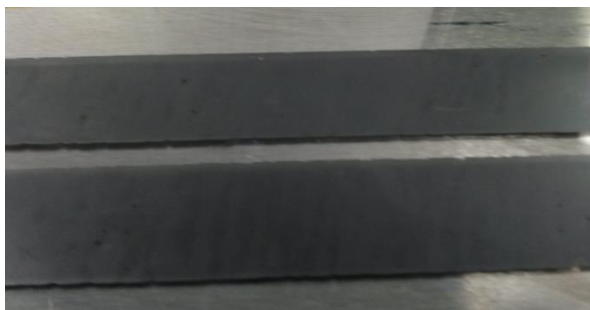
Fig. 1: one step slot-die coated hybrid halide perovskite

In this work we demonstrate the use of slot-die coating to deposit, in one step and in air, thin films of hybrid halide perovskites (Fig. 1) testing different experimental conditions. The layers obtained have been characterized through microscopic (optical and SEM), X-ray diffraction (XRD, see Fig.2) and profilometric measurements in order to evaluate them and find the experimental setup to obtain layers suitable for photovoltaic applications. Most of efforts have been spend in the control and optimization of the substrate wetting and perovskite crystallization process.